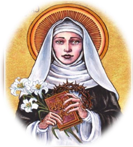
St Catherine of Siena March 25, 1347