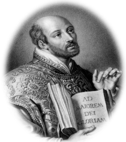
St. Ignatius of Loyola Oct 23, 1491 - Jul 31, 1556

“If God sends you many sufferings it is a sign that He has great plans for you, and certainly wants to make you a saint.”