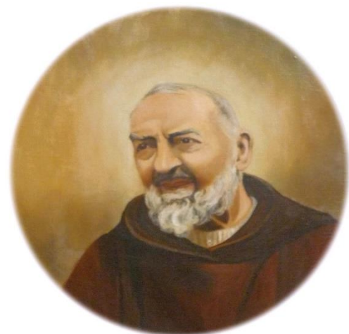
St. Padre Pio of Pietrelcina May 25, 1887 - Sep 23, 1968

“To be tempted is a sign that the soul is very pleasing to the Lord.”