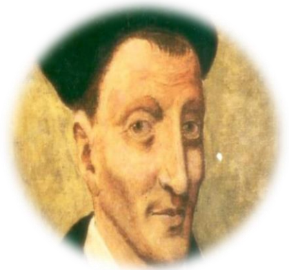
Thomas à Kempis 1380 - Jul 25, 1471