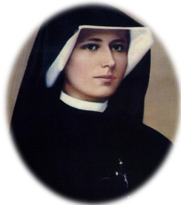
St. Faustina Aug 25, 1905 - Oct 05, 1938