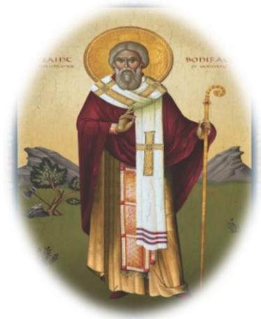
Saint Boniface 675 AD - 754 AD