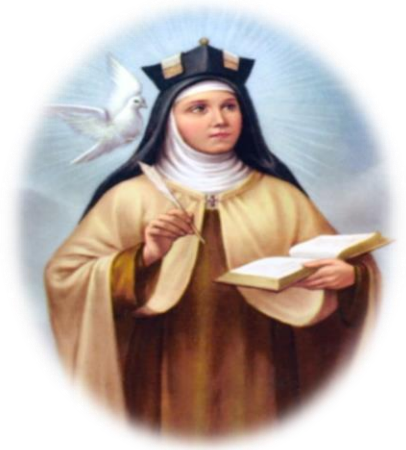
St. Teresa of Ávila Mar 28, 1515 - Oct 04, 1582

“It isn’t good to let our thoughts disturb us or worry us at all.” “He who possesses God lacks nothing: God alone suffices.”