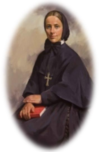
St Frances Xavier Cabrini Jul 15, 1850 - Dec 22, 1917