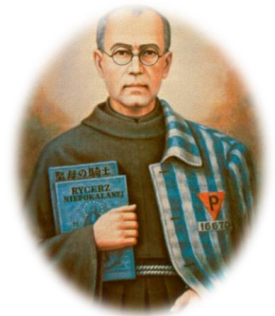
St. Maximilian Kolbe Jan 08, 1894 - Aug 14, 1941

“Never be afraid of loving the Blessed Virgin too much. You can never love her more than Jesus did.”