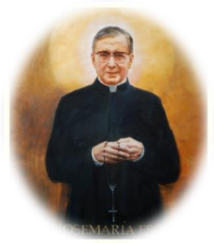
St. Josemaría Escrivá Jan 09, 1902 - Jun 26, 1975

“Those who pray and suffer, leaving action for others, will not shine here on earth; but what a radiant crown they will wear in the kingdom of life! Blessed be the ‘apostolate of suffering!’”