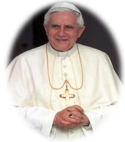
Pope Benedict XVI Apr 16, 1927