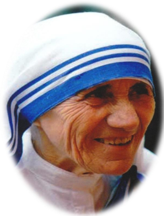
Mother Theresa of Calcutta Aug 26,1910 - Sep 05,1997