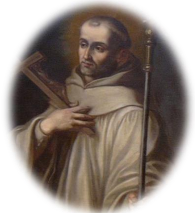
St. Bernard of Clairvaux 1090 - Aug 20, 1153