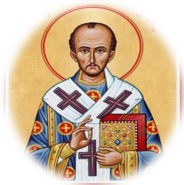
St. John Chrysostom 347 AD - 407 AD