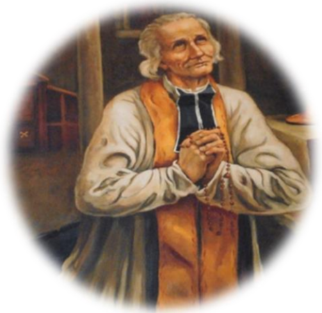
St John Vianney May 08, 1786 - Aug 04, 1859

“Hold your eyes on God and leave the doing to Him. That is all the doing you have to worry about.”