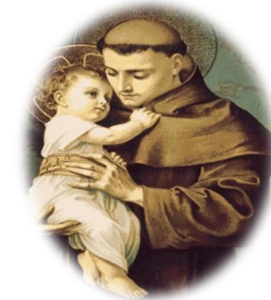
St. Anthony of Padua Aug 15, 1195 - Jun 13, 1231