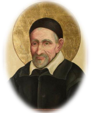
St Vincent de Paul Apr 24, 1581 - Sep 27, 1660