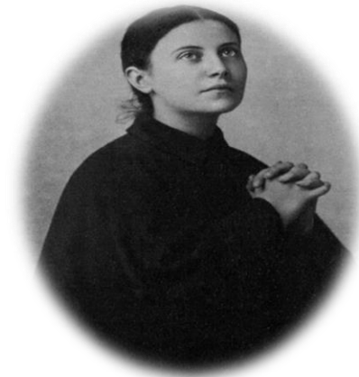
St. Gemma Galgani Mar 12, 1878 - Apr 11, 1903

When I shrink from suffering, Jesus reproves me and tells me that He did not refuse to suffer. Then I say ‘Jesus, Your will and not mine’. At last, I am convinced that only God can make me happy, and in Him I have placed all my hope...”