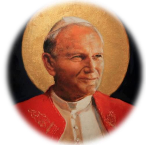
Pope John Paul II May 18, 1920 - Apr 02, 2005