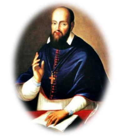
St Francis de sales Aug 21, 1567 - Dec 28, 1622