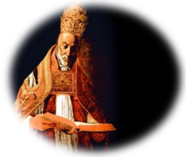
St Gregory the Great 540 AD - 604 AD