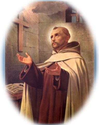
St. John of the Cross Jun 24, 1542 - Dec 14, 1591