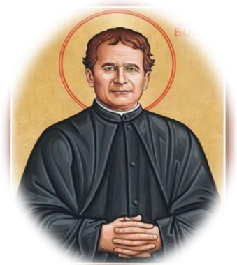
St John Bosco Aug 16, 1815 - Jan 31, 1888