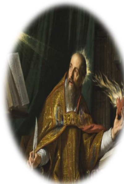
St. Augustine of Hippo 354 AD - 430 AD