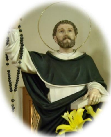
St Dominic Aug 08, 1170 - Aug 06, 1221