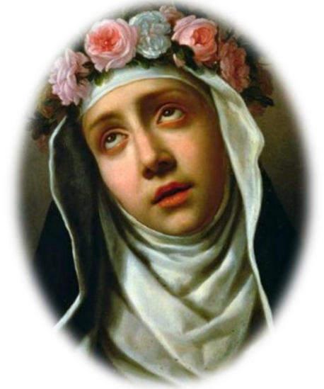
St. Rose of Lima Apr 20, 1586 - Aug 24, 1617