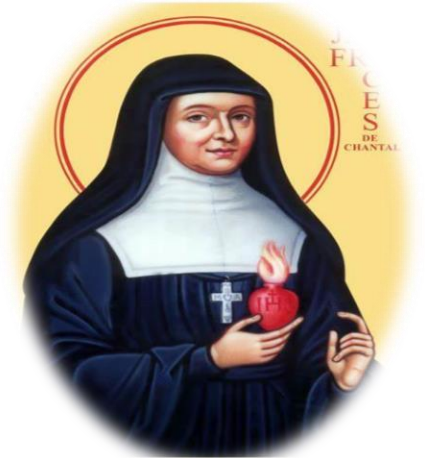
St. Jane Frances de Chanta Jan 28, 1572 - Dec 13, 1641

“Hold your eyes on God and leave the doing to Him. That is all the doing you have to worry about.”