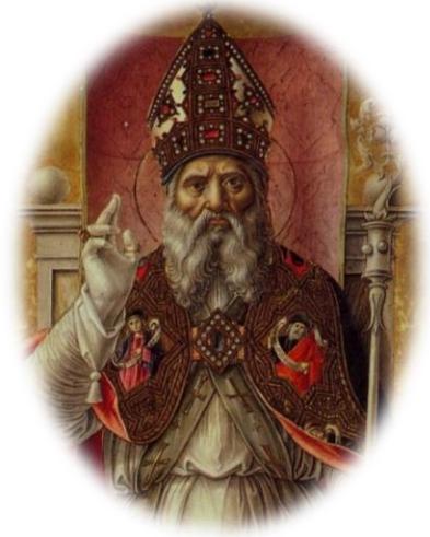
St Ambrose of Milan 340 AD - 397 AD